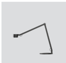
WINKEL BASE W227B

This EPD covers multiple variants of the Winkel collection: