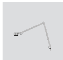
WINKEL PIN W227P